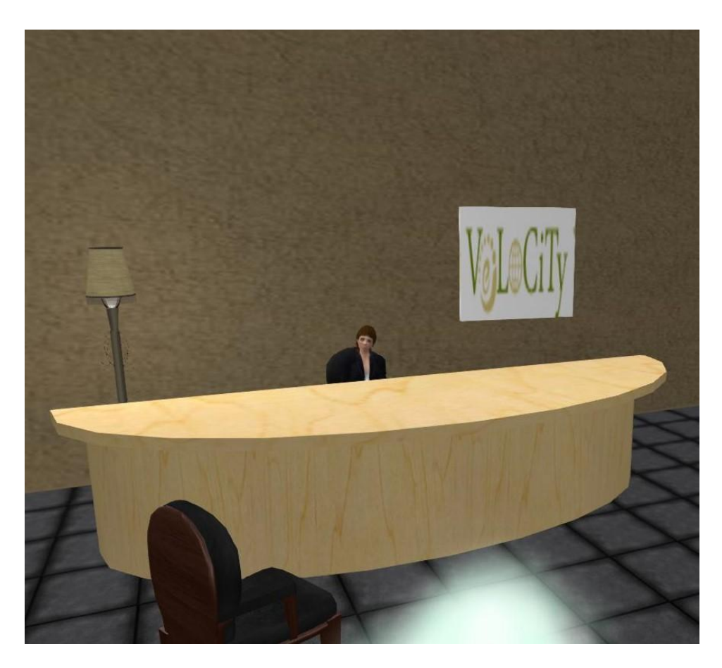
Figure 1. An example from an Avatar while testing OpenSimulator for VeLoCiTy Project

Regions in OpenSimulator are the building blocks of the virtual world. Each world hosted on the OpenSimulator environment consists of one or more regions. A region is the virtual physical space where avatars move and interact. It is a square patch of land (256x256m<sup>2</sup>) like an island on which mountains, buildings, etc., can be created. Every region is located at predefined coordinates on a XY axis on a VW map. They can be adjacent, forming greater land masses or apart. Transportation between distant regions can be achieved through teleporting. Users can build various 3D objects in such islands. Figure 2 shows a building created in OpenSimulator for the VeLoCiTy project in the stages of testing OpenSimulator.